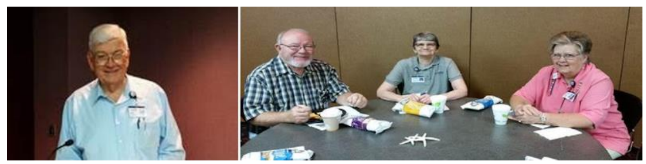
White County Medical Center volunteers enjoyed another year of helping out at the 21<sup>st</sup> Annual A Day of Caring where 1,340 people were served.