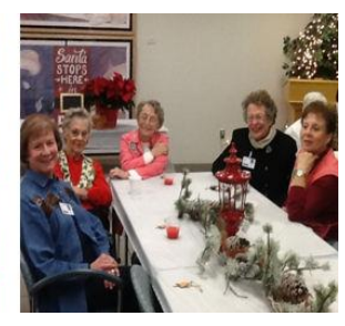
Christmas party pics.