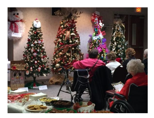
CrossRidge Community Hospital Auxiliary -