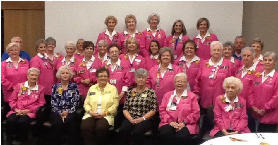
Fall Northeast Arkansas District Meeting hosted by NEA Baptist.